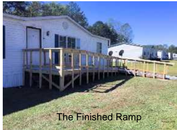
The Finished Ramp