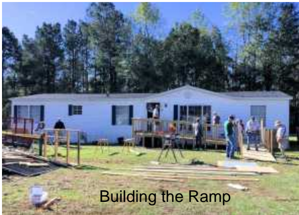
Building the Ramp

Some people have the idea that Civitan built ramps are free. This is not the case. The club charges only for the materials to build the ramp. The labor is free.