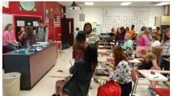
Planning the Fright Trail

The New Bern High School Junior Civitan Club sponsored the “Fright Trail” at the annual Fall Festival at Ben D. Quinn Elementary School. Each year, the school puts on this festival to help raise money for the children who go to the school. They have many stations set up around their campus for the students to participate in and this year Junior Civitan/AVID students were responsible for the most popular event...the haunted trail. Behind the school lies a creepy forest with a long and winding road. A strange and mysterious traveler will take a group of brave adventurers through the forest, encountering strange sights and terrors as they make their way along the trail and try to escape.