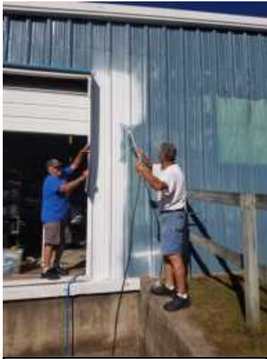
Spraying white primer over old blue paint

More help was needed when the Shelter’s Flea Market building was being sold and they had to vacate it and move to a new location. Several Civitan members assisted in that move. Once in their new location, the landlord said that if CCHS could paint the building (he would provide the paint) then he would take off $2000 from their bill. That’s when Civitan was asked again for their assistance.