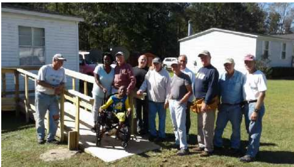
Ramp Builders With Ramp Recipient