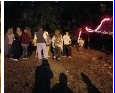
A Crowd gathers to enter the fright trail