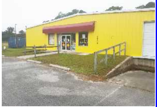
Painting completed and awning installed

Painting the new location of the Colonial Capital Humane Society (CCHS) Flea Market building was not a usual project for the New Bern Civitan Club. It goes back many months when CCHS was in danger of closing due to building violations set forth by the state. A call for help was put out to rectify the problems so the Shelter could remain opened. Closing the Shelter could have resulted in the euthanization of over 100 animals housed there. CCHS is the only “no-kill” Shelter in Craven County. This call to action was answered by many Civitan volunteers who helped to put the Shelter back into compliance with state regulations, thus keeping the Shelter up and running.