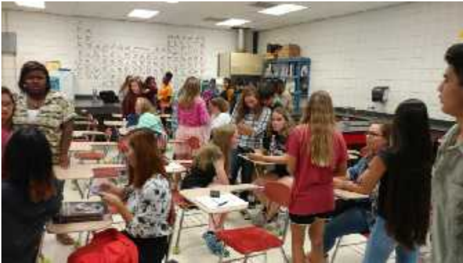
Planning the Fright Trail